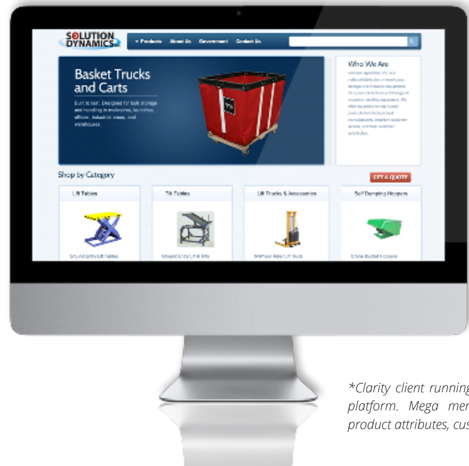
*Clarity client running on the Clarity eCommerce platform. Mega menu, extensive variants and product attributes, custom data importing.

Clarity specializes in delivering custom results within a timely fashion – read more below to find out how we can deliver a custom-tailored eCommerce solution that's designed